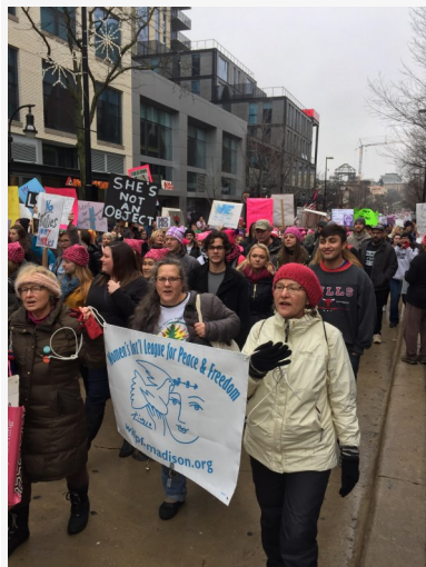
Madison Women's March 1/21/17

During our December plan meeting we also decided to resurrect a service component practice. We voted to support the newly created ' Open Doors for Refugees ' by assembling a few kitchen boxes each year. Look for the list of Box #1 on the next page and decide what you might donate; tell us at the next plan meeting and we'll assemble in March.